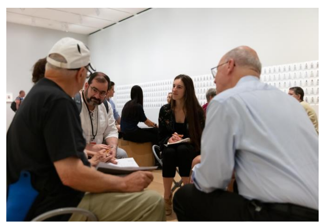
Participants introduce themselves and respond to an opening prompt.