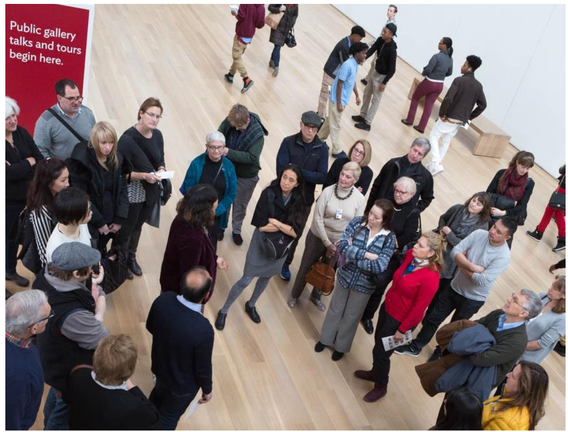
A group gathers for Intersections in Griffin Court.

"This is not a Highlights Tour where you will see 6-8 iconic artworks from the museum collection," I explain. "Instead, we will spend time with one or two works of art that offer us an entry to considering a particular current event or social question. We will shape the discussion together instead of me simply imparting information to you." Giving people the opportunity to opt-out if it is not the experience they are seeking has been key, and there are always a few who drift away from the group and decide not to participate. Museums have often been characterized as spaces of "informal" or "free-choice"<sup>9</sup> learning, because unlike